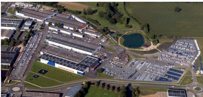
Gruau Group Headquarters

Visit our website www.gruau-usa.com for more information !