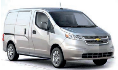
Chevrolet City Express