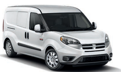
Ram ProMaster City