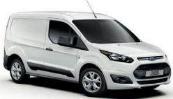
Ford Transit Connect