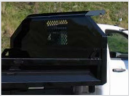
Tapered Quarter Cab Protector