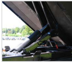
Body Raise Indicator