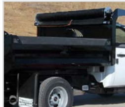
Poly Board Extensions