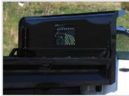
Straight Quarter Cab Protector