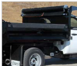
Poly Board Extensions