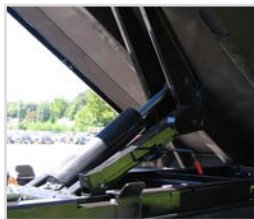
Body Raise Indicator