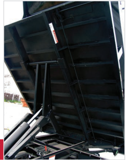
Stacked Crossmember Understructure