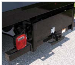
Class V Receiver Hitch