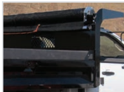
Straight Full Cab Protector