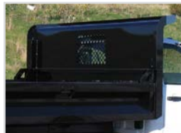
Straight Quarter Cab Protector