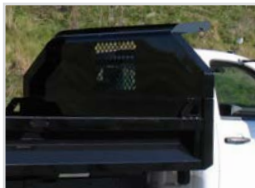
Tapered Quarter Cab Protector